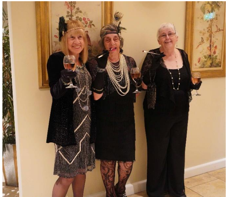
Carnival Glass Society Members Enjoying Pre-Dinner Drinks at our 2021 'Roaring 20s' Weekend